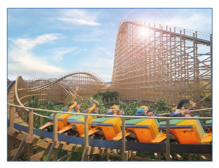
Tayto Park, Meath