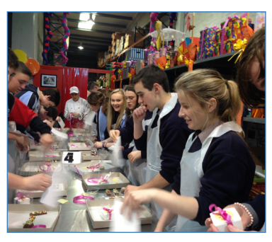
Chocolate Warehouse, Dublin