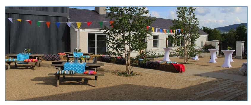
Airfield Farm, Dublin

Students can complete their required working hours while visiting cultural locations and getting a taste of the world of work.